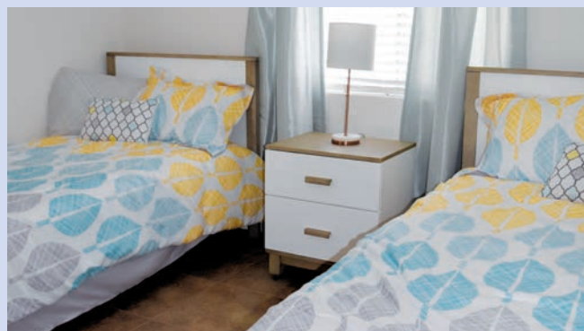
USAA apartment bedroom