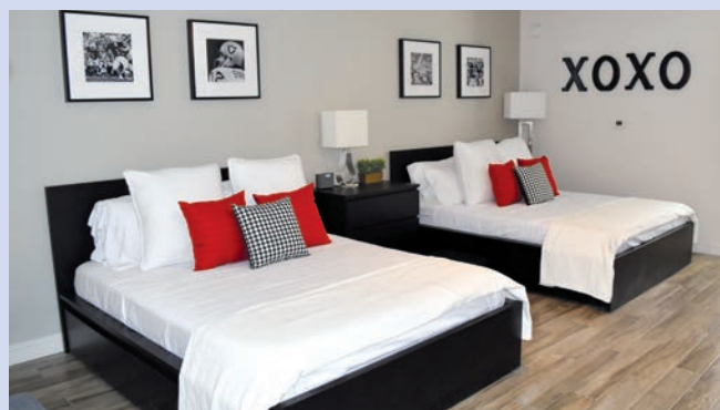
XOXO Stabler Foundation room

Ronald McDonald Houses feel different from a hotel because of the home-like qualities spread throughout each room. These details are showcased through our Adopt-A-Room program, which invites the community to uniquely decorate rooms that bring the comforts of home to families during their stay. Our most recent Adopt-A-Room renovations came courtesy of USAA and XOXO Stabler Foundation. Both groups made huge transformations on their space that will be enjoyed by many families who call the House a "home-away-from-home."