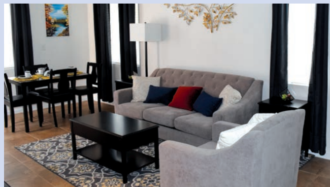
USAA apartment living room