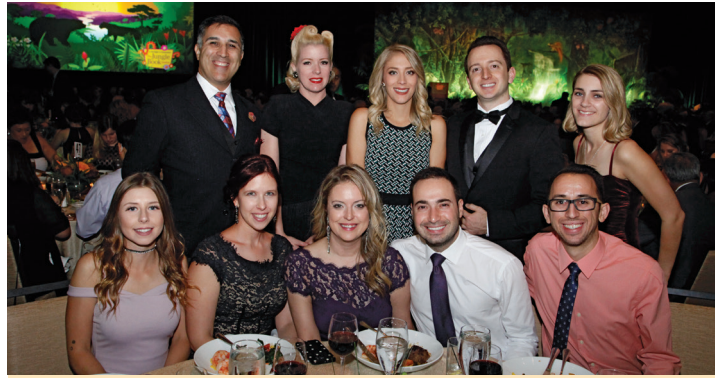
Red Shoe Society members at the 2016 McNight to Remember Gala.