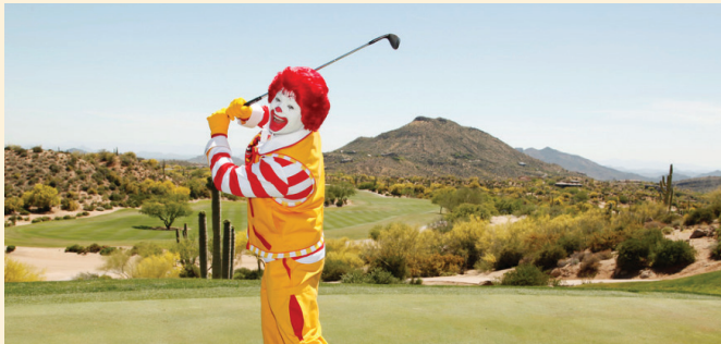
Ronald on Course