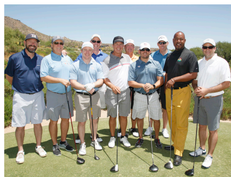
Team La-Z-Boy on the green