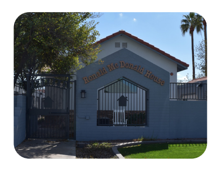
Roanoke House: Established in 1985

RMHCCNAZ operates three Houses in the Valley, offering a total of 72 rooms.